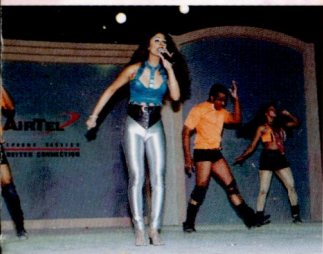
The Silver shine on Stage