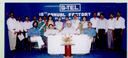
The gathering at G-Tel