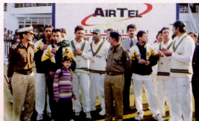
The Pakistan Cricket team at Gwalior

The run up to the Indo - Pak series began with a warm-up match between India (A) and Pakistan at Gwalior on January 23-25, '99. And the honour of sponsoring the match came to none other than AirTel.