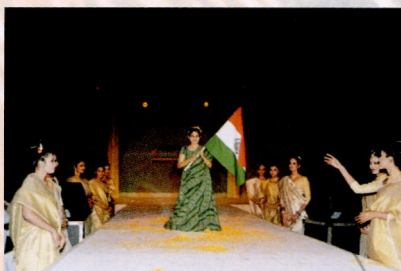
Fashion show on stage

for AirTel subscribers at Hotel Usha Kiran Palace added an exciting finale to the hectic day. A well-choreographed fashion show followed by a scintillating performance by famous singer Suneetha Rao pepped up the evening, while anchors Aly Khan and Nafisa Joseph regaled the audience with their spirited compering.