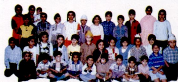
Drawing Competition for Children

The grand event was attended by all members of Ludhiana unit along with their families. The celebrations began with Shri Akhand Path Bhog ceremony in the morning. Later, the stage came alive with captivating dances, songs and skits by Bharti employees and their children.