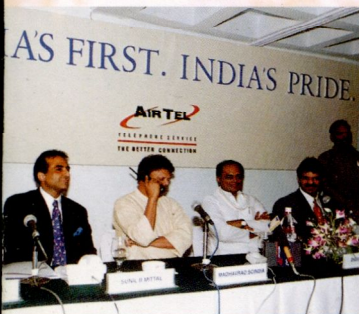
The first call...

The joyous day came to an end on a thrilling note, with AirTel having created history once again.