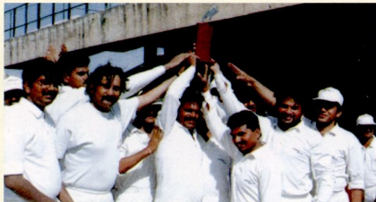
Rest of Bharti-Runners up

Bharti Cricket Masters, became a first time group-wide cricketing extravaganza held in March, '99 - another inspiring new chapter, initiated to augment the spirit of camaraderie and togetherness in the entire Bharti Enterprises family. The first tournament of this event was organised at IIT Delhi Grounds, which resounded with the throbbing spirit of cricket-loving Bhartians for three weekends. There were spirited clashes. Unexpected wins. Striking scores and much much more.