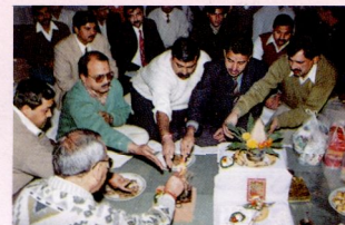
Pooja at AirTel house, Gwalior

The AirTel house at Gwalior was formally inaugurated on February 4th, 1999. A Bhoomi Pooja was performed to mark the auspicious occasion.