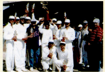
Bharti Cellular - Winners