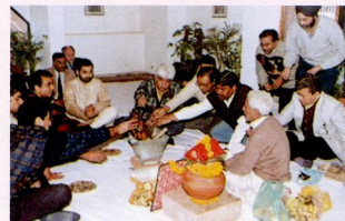
The Havan at BBIL premises