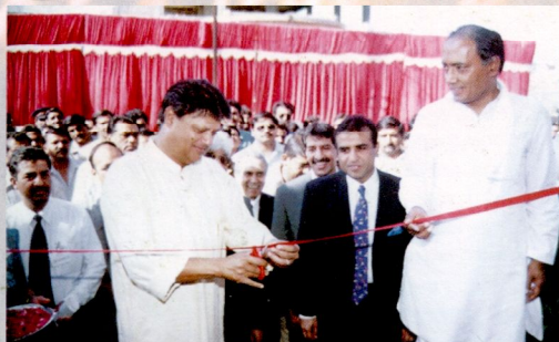
Mr. Madhav R. Scindia cutting the ribbon while Mr. Digvijay Singh CM, M.P. and Mr. Sunil B. Mittal look on.

B harti Telenet, India's first fixed line telephone service provider in the private sector, launched the third leg of its basic telecom services in Gwalior and Malanpur. The historic first-call event was conducted on March 20, '99.