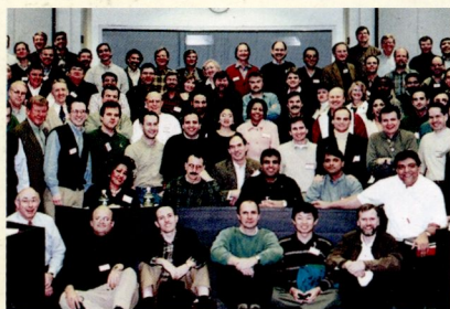
OWNER/PRESIDENT MANAGEMENT PROGRAM CLASS 27 HARVARD BUSINESS SCHOOL

Mr. Sunil Bharti Mittal has become an alumnus of Harvard Business School in January this year. Mr. Mittal successfully completed the Owner/ President